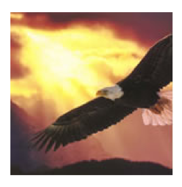
Talks in Benares, Ojai and Ommen, 1928