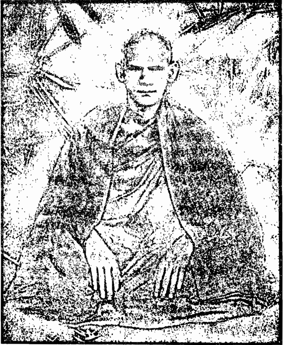
The Venerable Mahāsi Sayādaw, Bhadanta Sobhana Mahāthera, Aggamahāpāṇḍita.