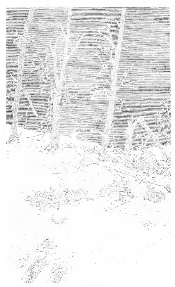
THE TERRIBLE VEAR.