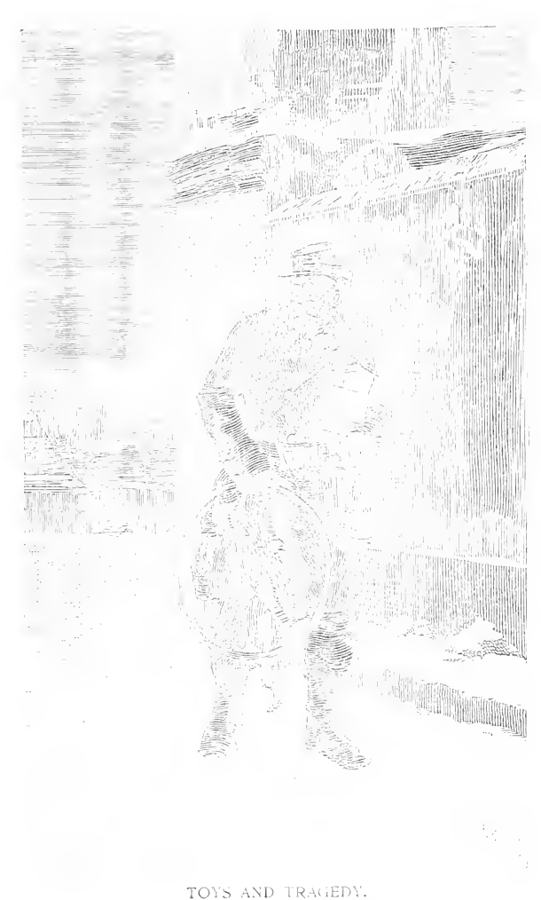
-Victor Hugo, Vol. XVII., p. 218.